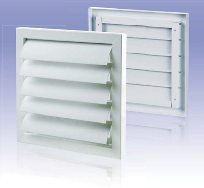
Ventilation grille with gravity shutters